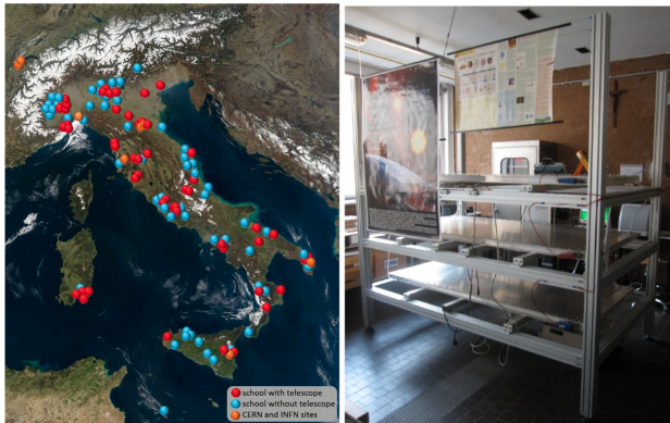
FIG. 3. The EEE network (left). Red and orange dots indicate the locations of the EEE stations in high schools and at CERN or INFN laboratories, respectively. Cyan dots mark schools participating in the project without a telescope. On the right, one such telescope is shown. Figure taken from [31].

Long term collaborations are organised with schools. French institutes have developed Cosmodetecteurs and COSMIX suitcases shared with schools, training programs, and even installed a full set of detectors on top of the Pic du Midi Observatory [28]. In the US, QuarkNet [6] organizes multiple cosmic ray activities through long-term collaborations between high school teachers and scientists. During the International Muon Week [29], paired schools collect and analyse data and share the results they have obtained. In Italy, the INFN Outreach Cosmic Ray Activities (OCRA) [30] project involves 24 INFN divisions, offering activities for both students and teachers. The Extreme Energy Events (EEE), shown in Fig. 3, is one of the most successful projects. It is a large area array based on multigap resistive plate chambers (MRPCs), where students are directly involved in the assembly, maintenance and data analysis. In the same spirit as