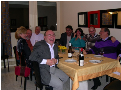
Dinner in my place with other joyful Greeks, 30/01/2010.