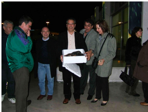
A night visit to the Rungis market, 25/11/2006.